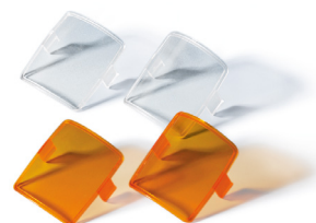
Inspection window 1 set colorless and 1 set amber colored (light shield)